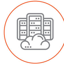
SAP HANA Enterprise Cloud