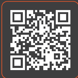
Alibaba Cloud for SAP

To learn more about the Alibaba Cloud solutions featured in this case study, scan the QR code below and visit the following websites: